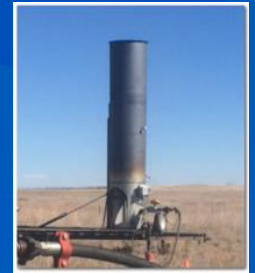
ECD (Emission Control Device)